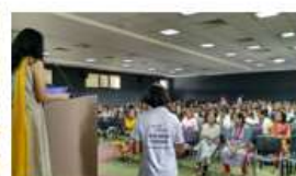
Manav Rachna Univ.