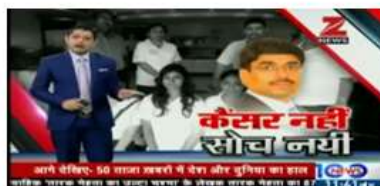
Zee News Coverage