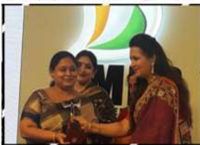
Women achiever’s award 2017 by “ Naaz Foundation, Dubai ”