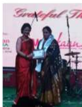
Women of India Award 2016 by Muskaan Foundation