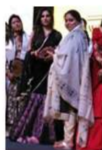
Women of Excellence award 2017 by “ Meri Delhi ”