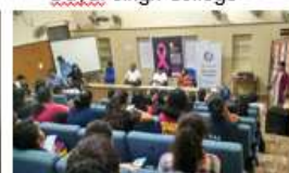
Laxmi Bai College