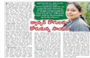
Telugu News Paper Enudu