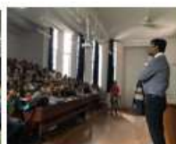
Dayal Singh College