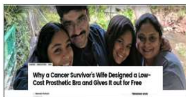
The Better India